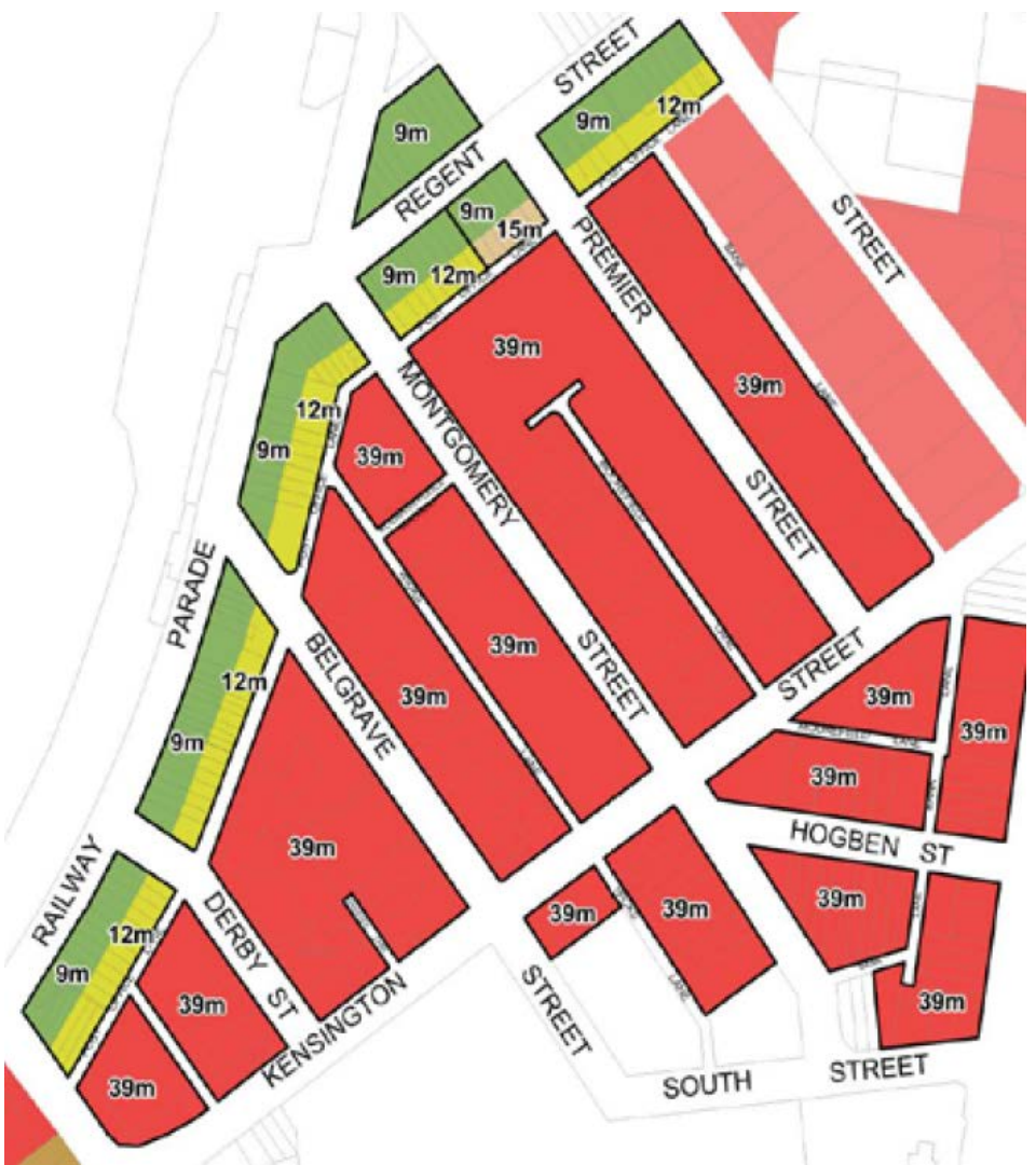
Figure 1: Proposed Height of Buildings, New City Plan