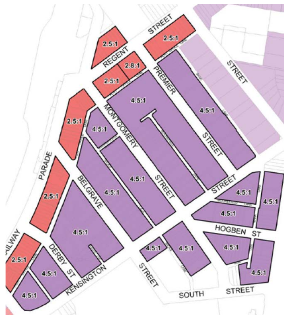
Figure 2: Proposed Floor Space Ratio, New City Plan