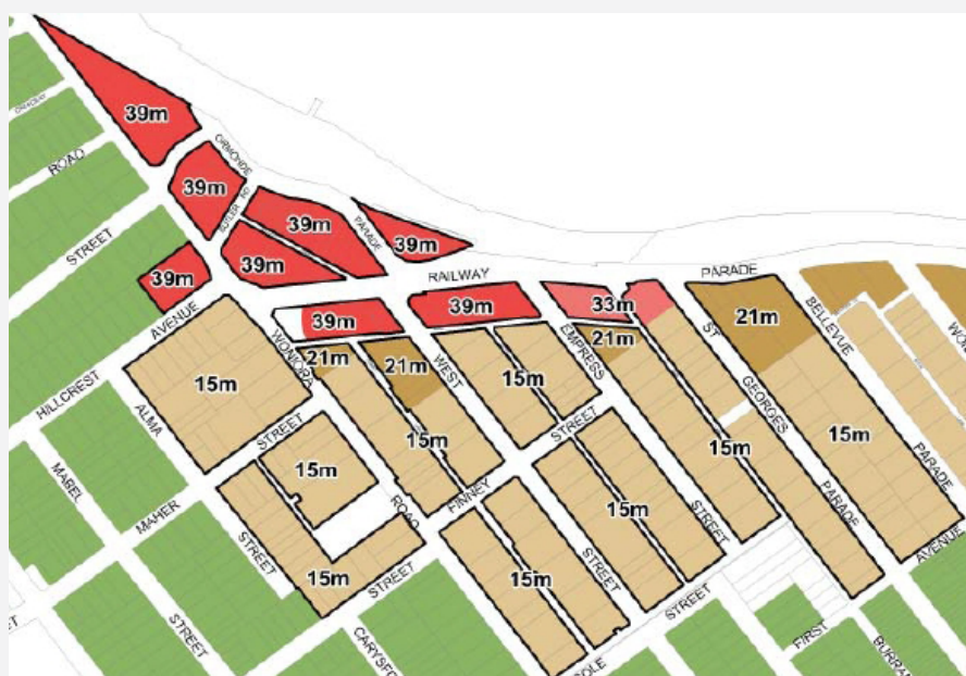
Proposed building heights for Hurstville Centre