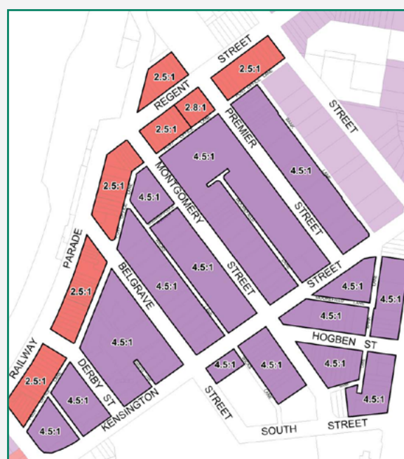
Proposed floor space ratios for Kogarah Town Centre