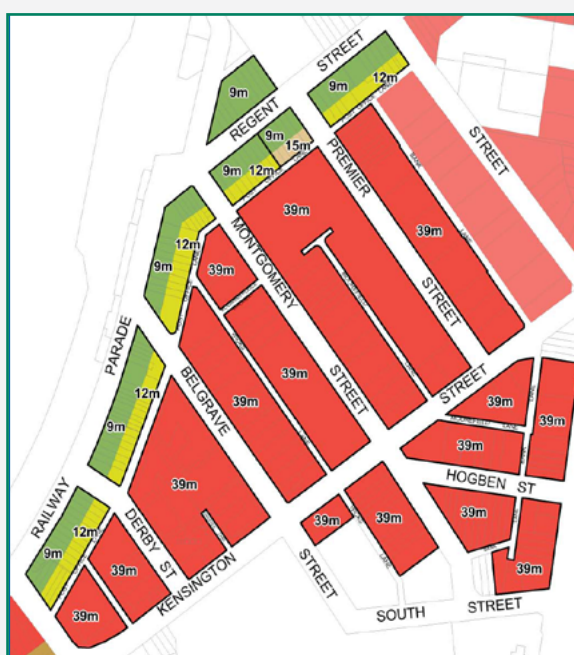
Proposed building heights for Kogarah Town Centre