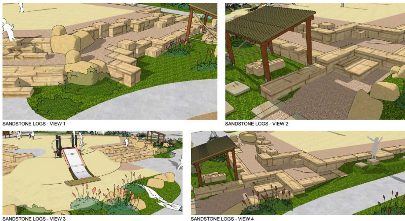
Figure 3: Above perspective are indicative of completed sandstone logs installation within the play space.