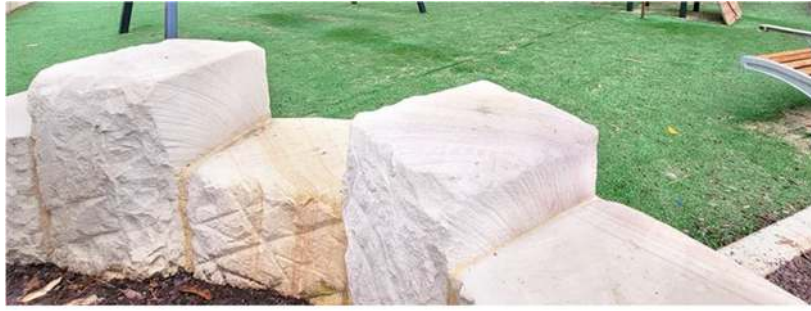
Example Image: 1