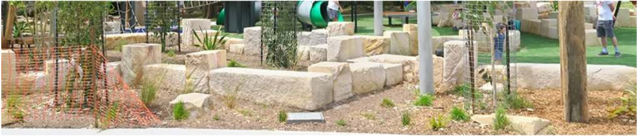
Example Image: 2