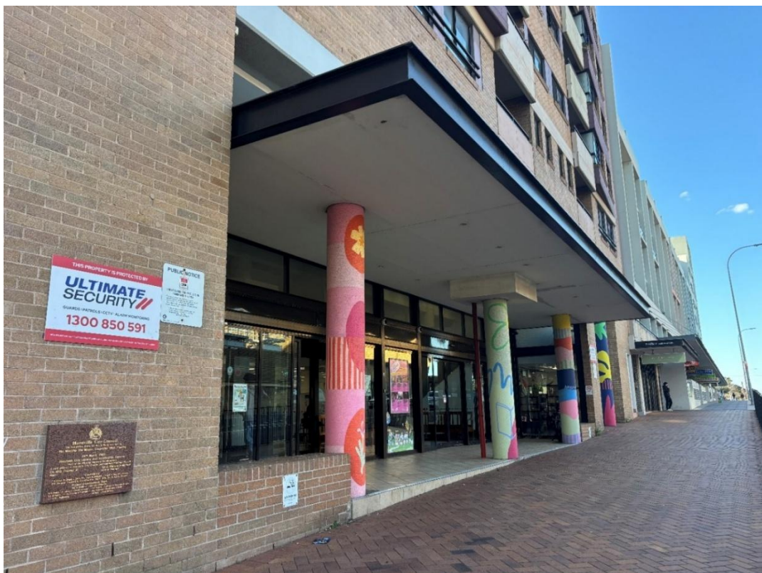
Figure 1: View of entryway of Hurstville Library.

Hurstville Library is situated on the corner of Dora Street and Queens Road, Hurstville NSW.