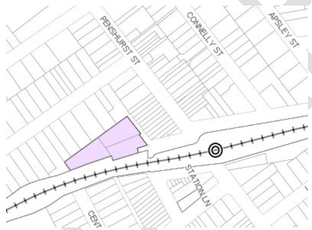
Figure 1: Penshurst Lane, Penshurst industrial precinct