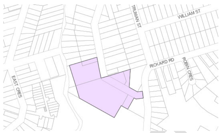
Figure 2: Halstead Street, South Hurstville industrial precinct