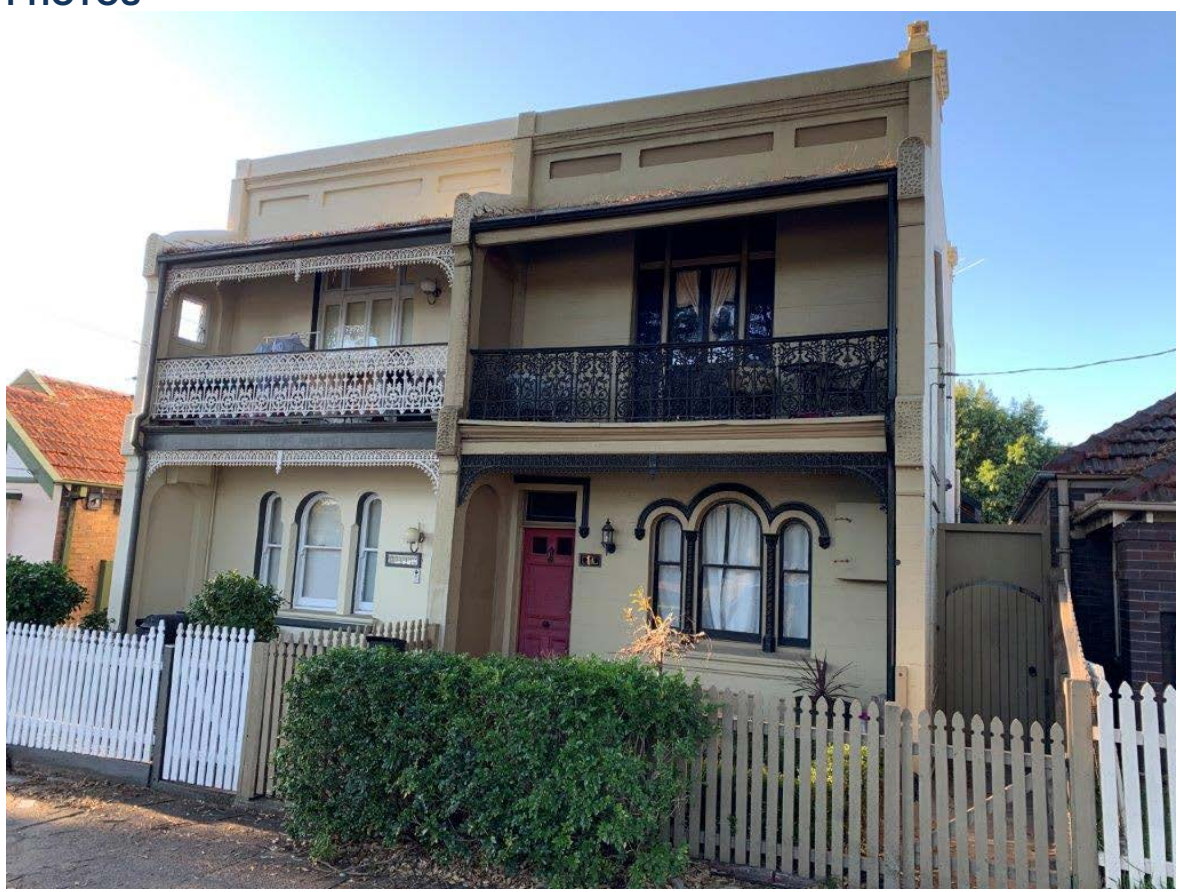
Photo 1 - Overall Photo of 14-16 Victoria Street (Sagging Balcony)